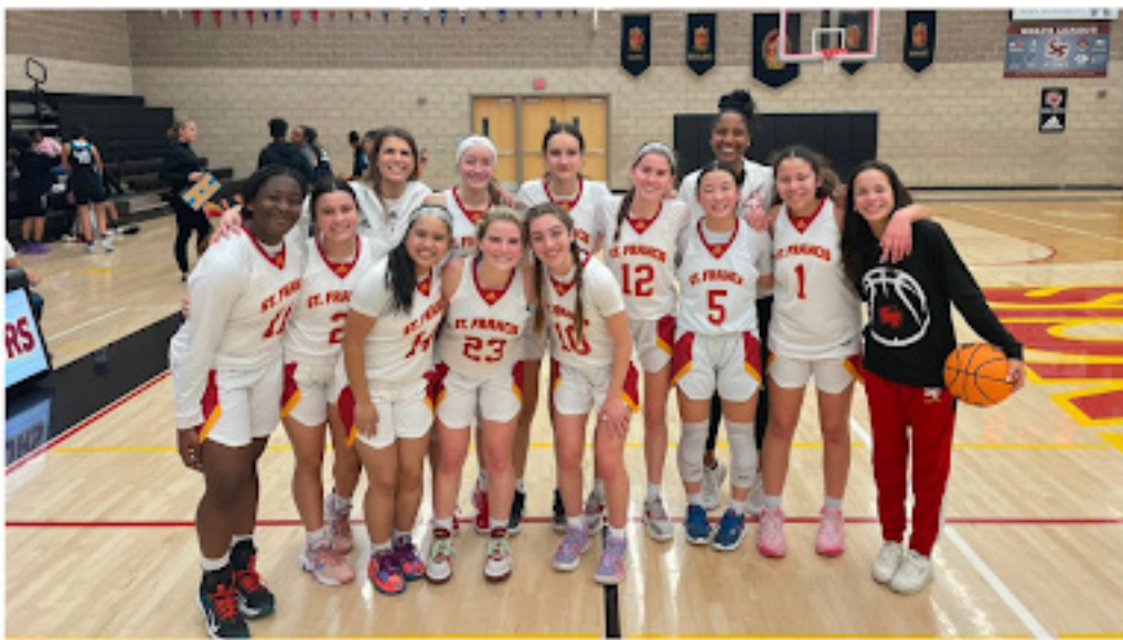
St. Francis players celebrate after clinching the Delta League championship with a 63-25 victory over Sheldon on Wednesday, Feb. 8, 2023.