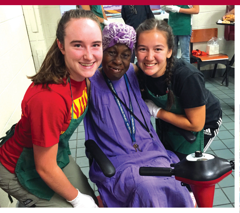
SFHS students in their junior year can participate in service trips to destinations including New Orleans, New York (the Bronx), Baltimore, San Diego, San Francisco, Winnebago, Nebraska and other locations.