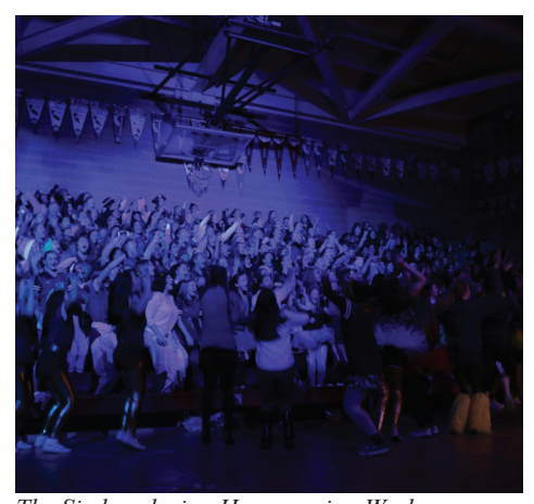
The Simbas during Homecoming Week.

the night. The next day was our big day, the rally, where we got to show everyone how far we had come over the week and give it our all. I know I wouldn't change a thing, especially for it being our first year.