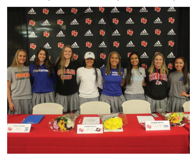
The senior signees line up for a photo taken on Signing Day.

Fall and winter athletics--water polo, soccer, vollevball, cross country, tennis, golf, and basketball--ended with successful seasons, all being able to compete in Sac-Joaquin Section Playoffs. Water Polo concluded an outstanding season being selected to play in the first CIF Nor-Cal Division 1 championships, and seated as the No. 2 seed for the Sac-Joaquin Division I bracket, just behind Davis High School in the finals. Women's soccer was able to advance to the Sac-Joaquin Division I quarterfinals, unfortunately falling to Granite Bay in their final game. Soccer troubies earned an overall notable 16-6-4 record. Troubie golfers had a fantastic term, not only bringing home the Delta League title, but also shutting-out an undefeated season with eight wins. St. Francis volleyball had an amazing season this past fall not only making it to the Sac-Joaquin section finals, but also bringing in incredible seasons stats of 29 wins and 8 losses. Cross Country finished the Division II race as sixth overall and gained their sixth, Top 10 State Champion-