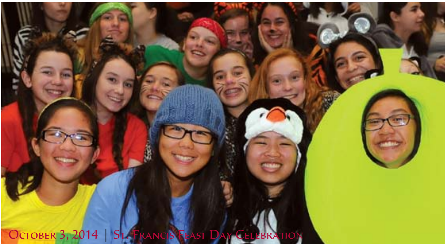
OCTOBER 3, 2014 | ST. FRANCIS FEAST DAY CELEBRATION