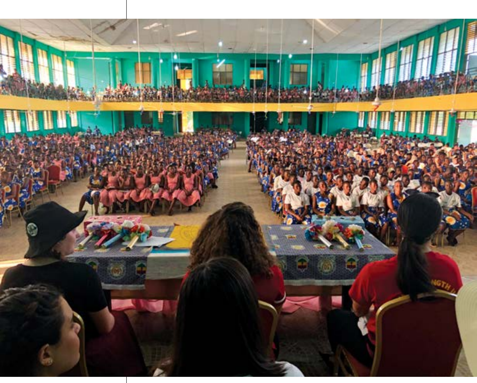
TO SEE MORE PHOTOS AND VIDEO FROM THE TRIP, VISIT WWW.STFRANCISHS.ORG/GHANA

pared meals that were a combination of American and traditional Ghanaian dishes. Our group was both humbled and moved by the love and care put into preparing and serving each meal, which spoke to the hospitality of the Ghanaian culture. The evenings were spent watching and learning about dances, stories, and poetry that both educated and entertained. "On a usual night, we would be sitting in a circle on the floor together, teaching each other new aspects of our own cultures, all laughing and enjoying each moment. I loved how connected we became in such a short period of time,"