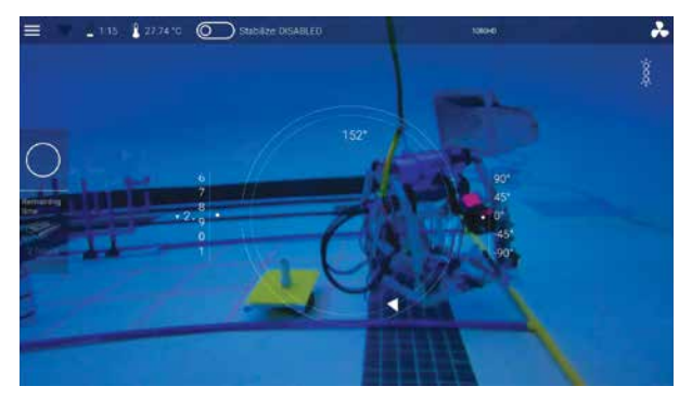
ENHYDRA IN ACTION AT THE WORLD CHAMPIONSHIP

The whole team is excited for the release of the competition manual, as this will detail the missions that our ROV should be equipped to complete. This year's challenges revolve around marine renewable energy, aquaculture, and the Antarcticall real-world applications. You can read more about these on materovcompetition.org, and continue to track our team's progress through updates on the St. Francis Instagram account, @sfhs_troubies! The team would like to thank the St. Francis community for all the support we've received!