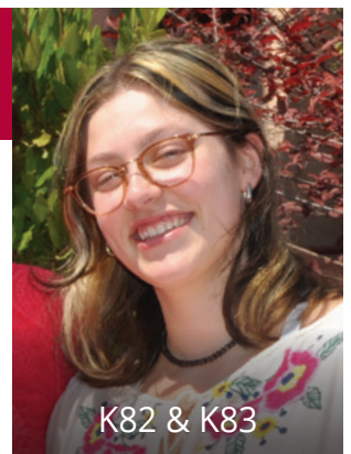
K82 & K83

to me because I wanted to be able to give the students of SF an experience that I was so thankful for. I realized how much Kairos gave to me; I wanted to give back that gift. After attending Kairos as an alumnae, I realized that there is always something that I can learn about myself and that there is room for me to constantly grow as a person.”