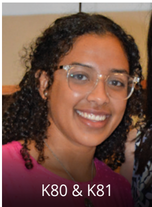
K80 & K81

realize how much the girls in my group would boost up my life as well. I feel as if I’ve done a lot of growing in the two years since graduating and I was glad to share everything I learned up until that point. Through Kairos, I saw how much I love to talk to people and really listen to people. Additionally, I realized how important mental health is and that is what inspired me to pursue psychology as a career and in the future, receive my doctorate. At the end of the day, I will always remember the Kairos with a big heart and will be eternally grateful for that experience.”