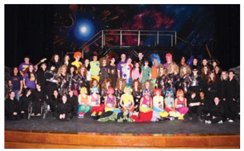
Cast & Crew of St. Francis' 2010 Spring Musical "Starmites"