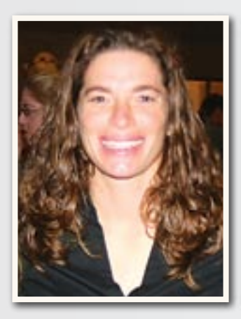
One of my fondest memories came from watching our student athletes display great sportsmanship at one of the highest levels of competition- at a match they lost.

The young ladies that graduate from St. Francis receive a wonderful education that challenges their minds. They also receive an education that challenges their hearts and souls to let their spirit shine. Most importantly, they become and remain part of a community, a family beyond their immediate family. To me, that is the essence and spirit of St. Francis. *