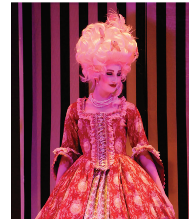
Imaginary Invalid (2013)