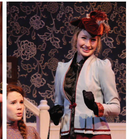
Ann of Green Gables (2012)