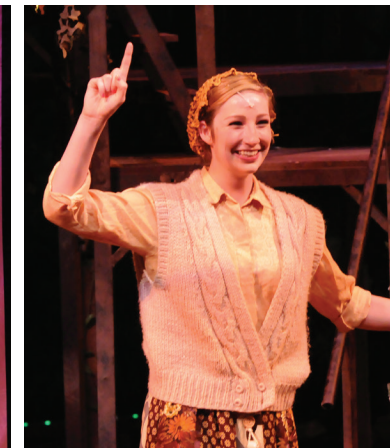
Into the Woods (2012)