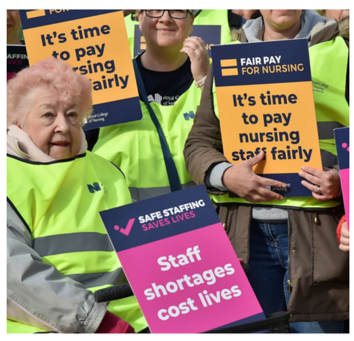
British nurses launch a historic strike in an effort to achieve higher pay.

Striking nurses, who are largely represented by the Labour Party, have critiqued the government's conservatism for failing to meet their demands. Steve Barclay, the Secretary of State for Health and Social Care, forged a