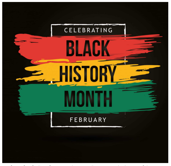
The Black Student Union at St. Francis is working tirelessly to shed light on the beauty of Black culture.

The Celebrating Black Culture assembly brought something St. Francis hadn't seen before. Outside performers visited to bless the community with their beautiful voices and physical art forms. St. Francis also invited the CKM step dance team to perform in the middle of the assembly. The team's performance filled the gym with incredible energy. Following the dance, audience members joined the team and BSU council members for an intense game of