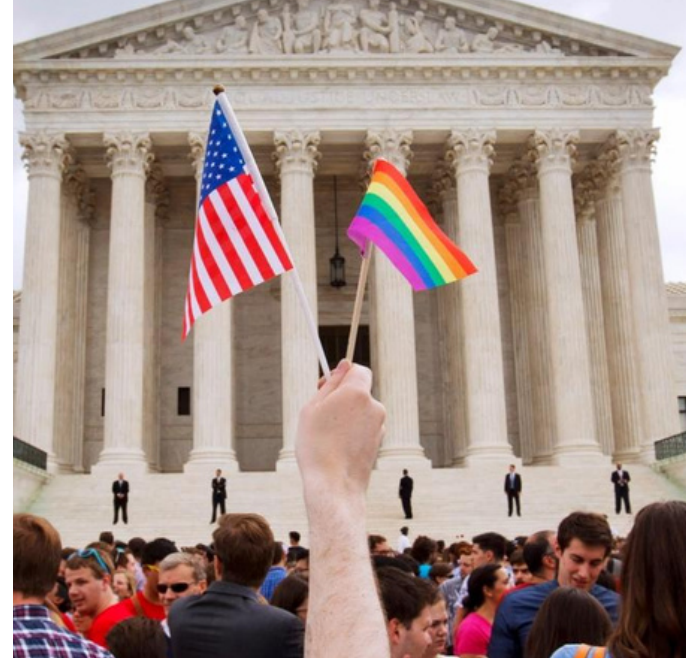
The Respect for Marriage act requires all US states to recognize the validity of same-sex and interracial marriage.

This landmark legislation officially erases the Defense of Marriage Act, which defined marriage as between a man and a woman. The new law prohibits states from denying the validity of out-of-state marriages based on sex, race, or ethnicity. Although it does not guarantee the right to marry, it makes it so that other states have to recognize same-sex marriages across state lines and that same-sex couples are entitled to the same federal benefits as any