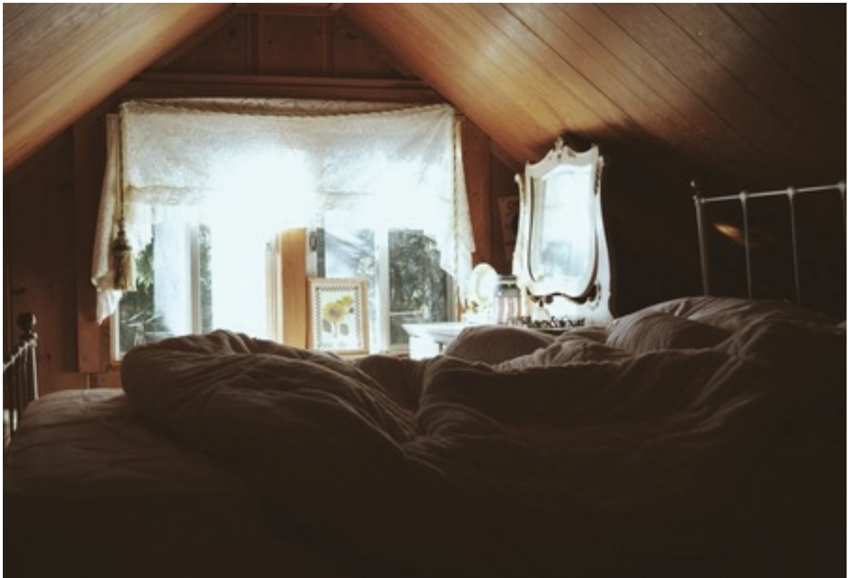
“Day” Cassandra Peralta