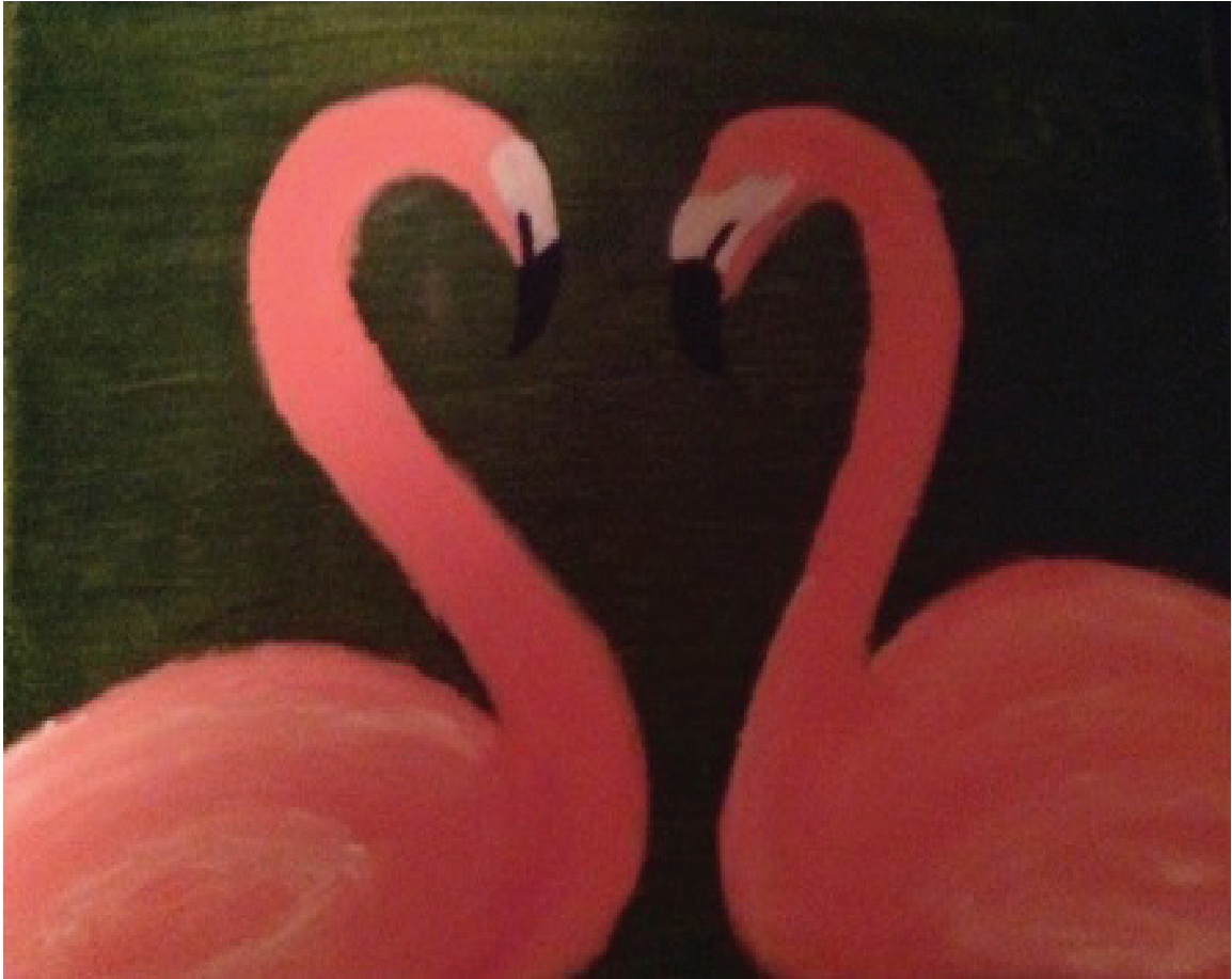
“Green” Kendall Cecchettini