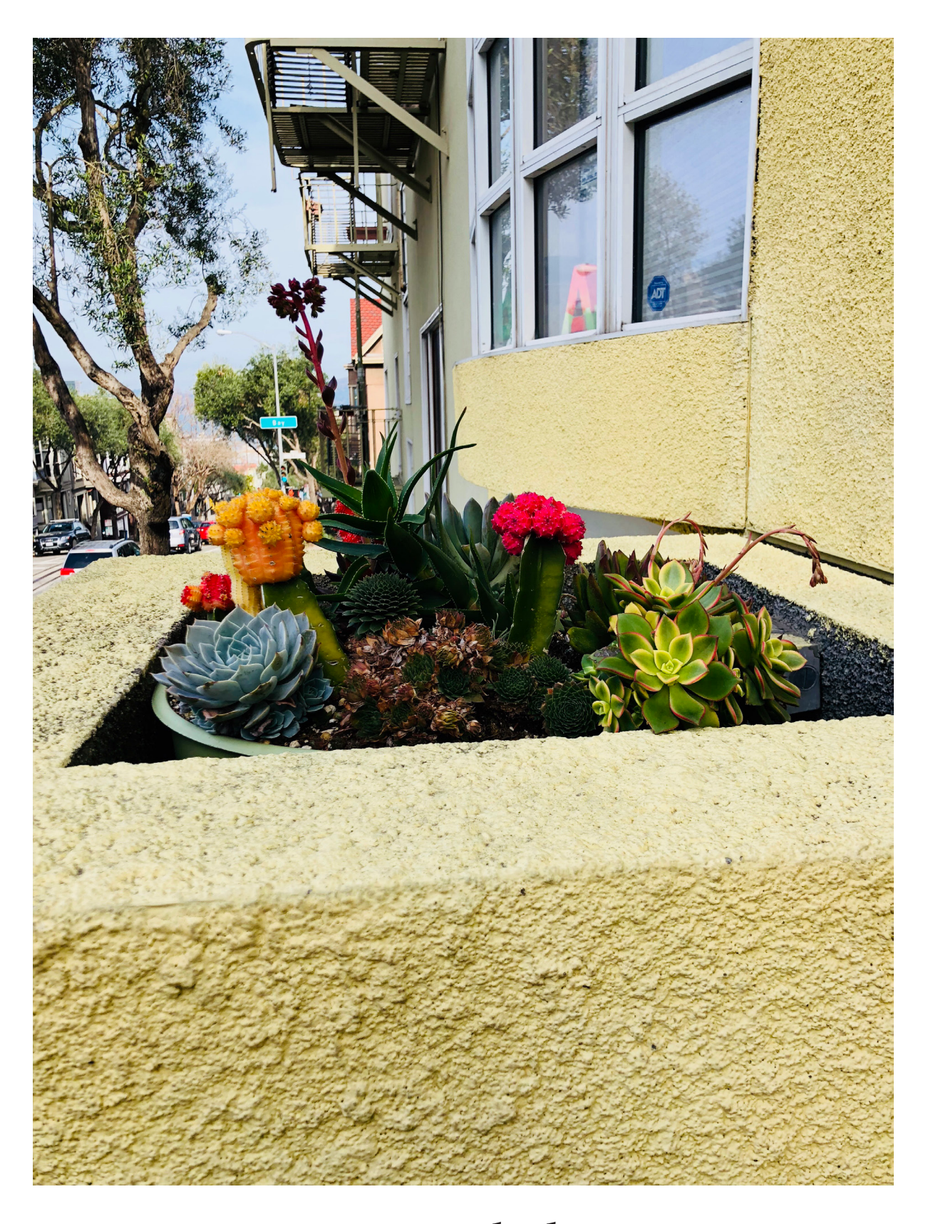
Untitled Janene Tapken