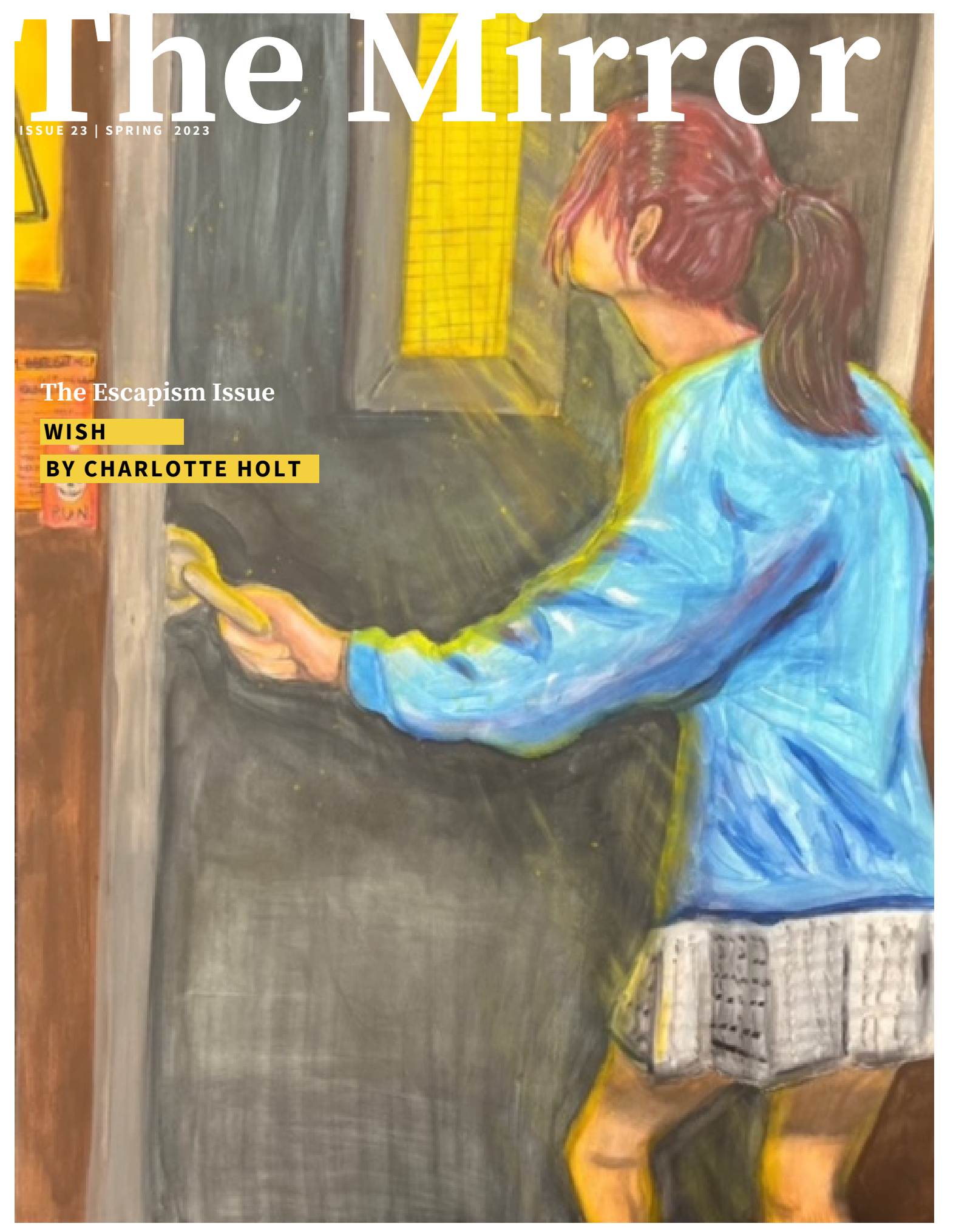
The Saint Francis Catholic High School Student Run Liberal Arts Magazine: Literature, Poetry, Arts, Research, Discovery, Imagination